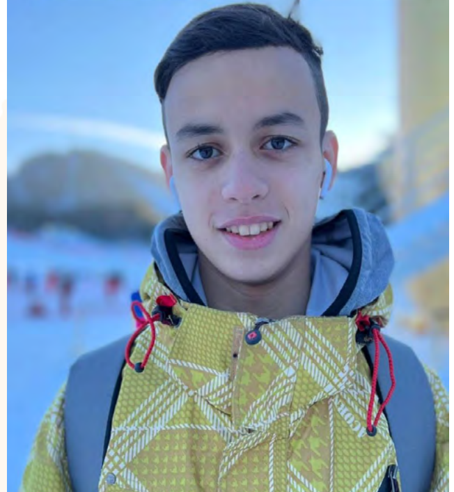
Team Morocco 🇲🇴 ❤️