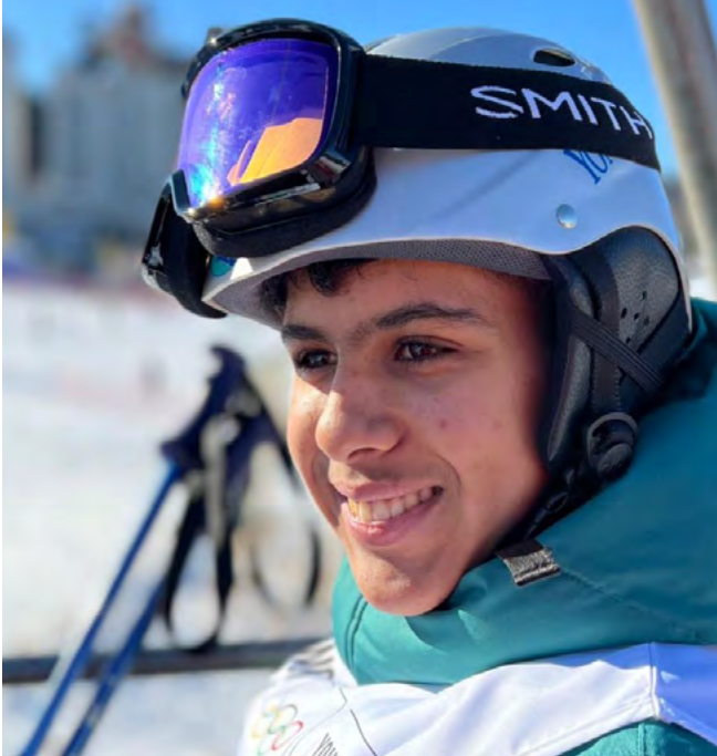
Team Algeria 🇩🇿 ❤️