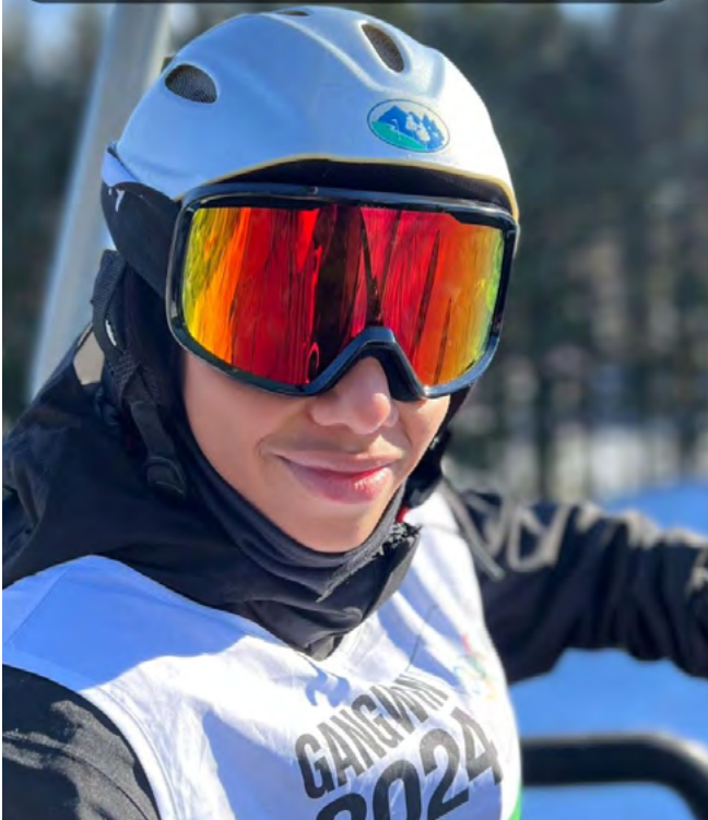
Team Tunisia 🇹🇳 ❤️