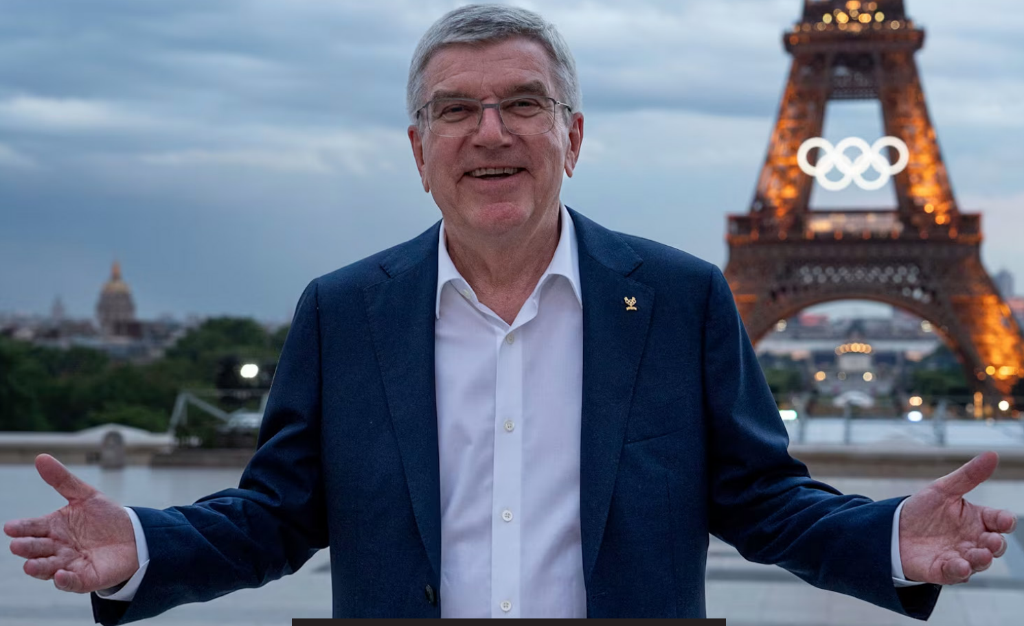
IOC PRESIDENT BACH

NEWSLETTER ON AFRICA'S PARTICIPATION IN THE OLYMPIC GAMES