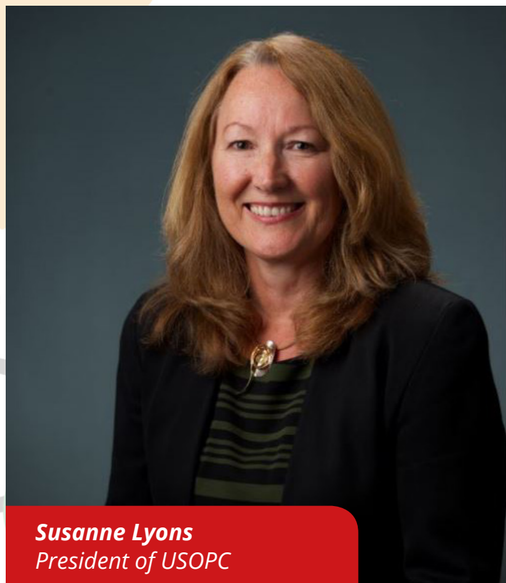
Susanne Lyons President of USOPC

2019 in Doha, Qatar. The following areas of cooperation are targeted: