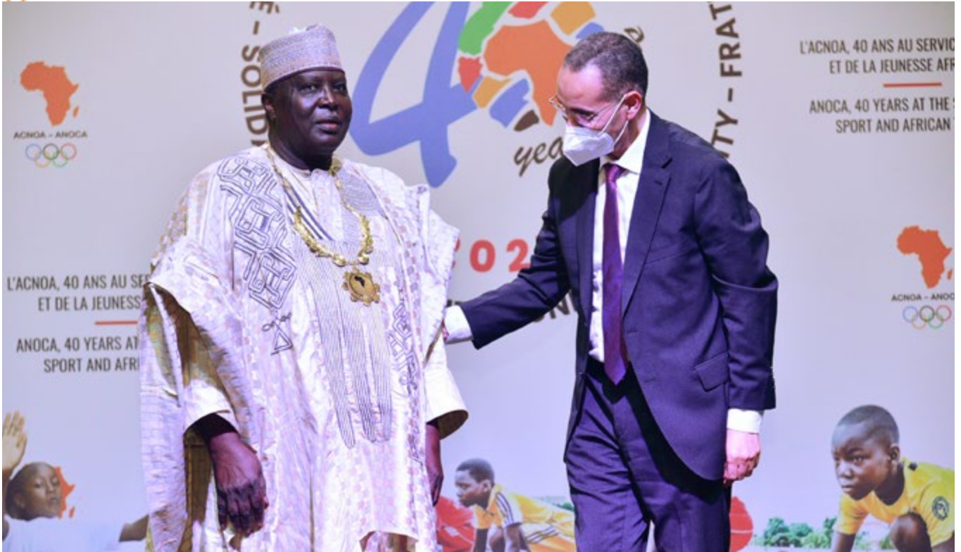
Keino, former Olympic champion (1968 and 1972), and former Kenyan NOC President; Intendant