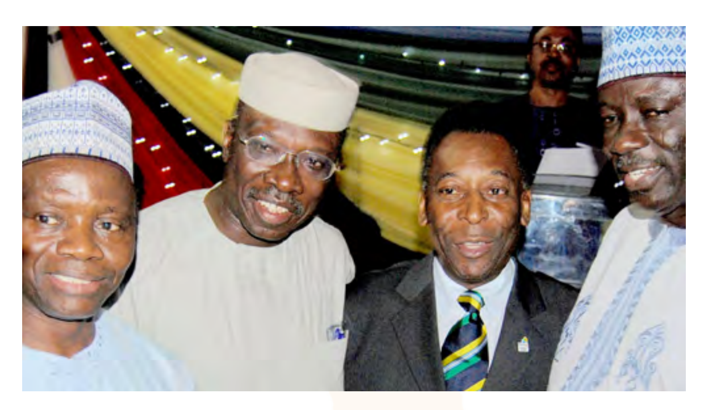
hail King Pelè's great work.

The entire African Olympic and Sports Movement will mourn him and light the Olympic flame in his memory.